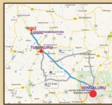
LOCATION MAP OF NIMZ, VASANTHANARASAPURA